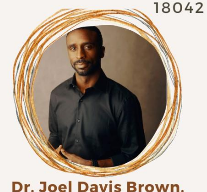
ESQ., PCC Keynote Author, <u>The Souls of Queer Folks</u>